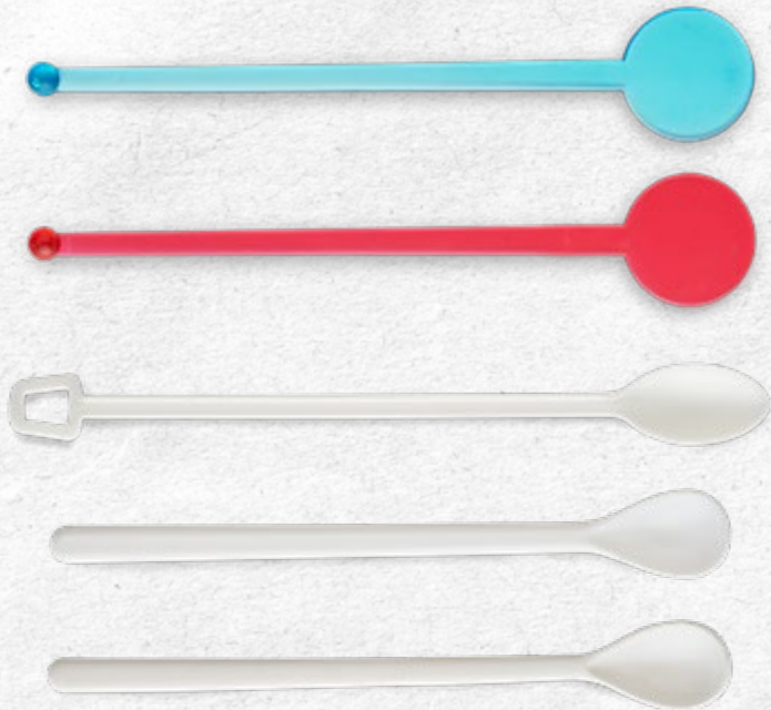
Plastic and compostable plastic (PLA) beverage stirrers

Any stirrer made from, or comprising, fossil fuel derived plastic or compostable plastic which is designed to be used once, or a limited number of times, before being thrown away.