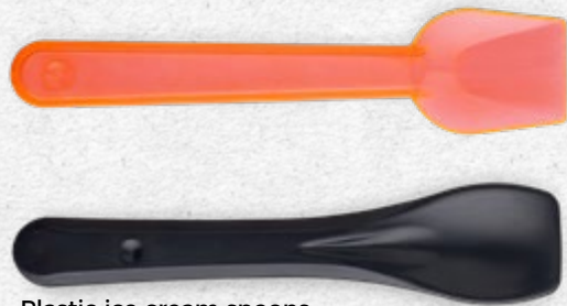
Plastic ice cream spoons