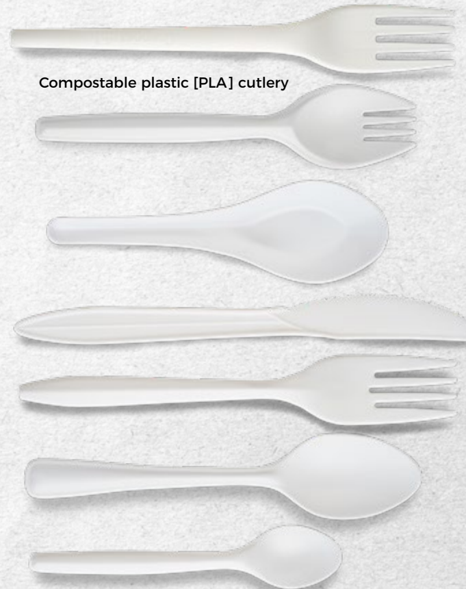
Compostable plastic [PLA] cutlery

Any utensil that can be used to eat food. This includes spoons, forks, knives, sporks, splayds and chopsticks which are designed to be used once, or a limited number of times, before being thrown away. Exemptions will also apply to cutlery that is attached as part of a pre-packaged product e.g. a plastic spoon attached to a yoghurt tub.